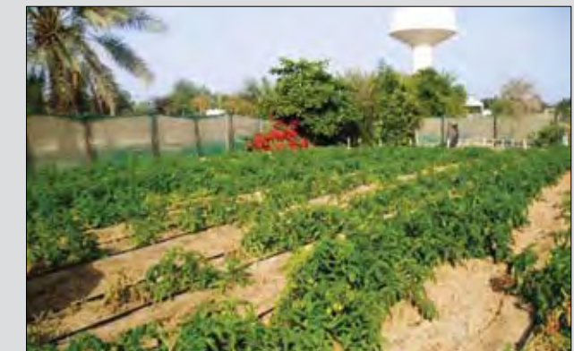
Fig. 2. Bahrain trees and vegetables tests in 2004