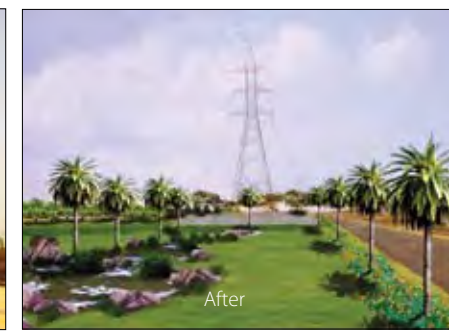
Fig. 6. Dubai, UAE lagoon test in 2009

and soil properties so to the irrigation conditions specificity. Here we mean the scheme of the agricultural areas arrangements, rates, periodicity and specifications of the irrigation. As to the properties of the regional ground and soils, it is rather important for us its mineralogical composition and a specification of the irrigation water.