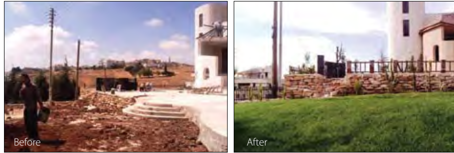
Fig. 3. Jordan lawn grass test in 2005 (1)