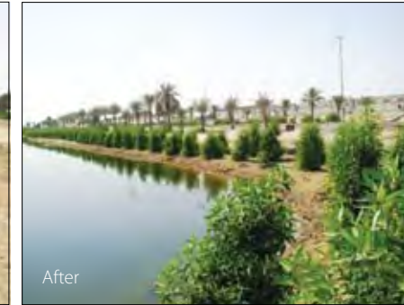
Fig. 5. Dubai, UAE salt lake test in 2008 (1)