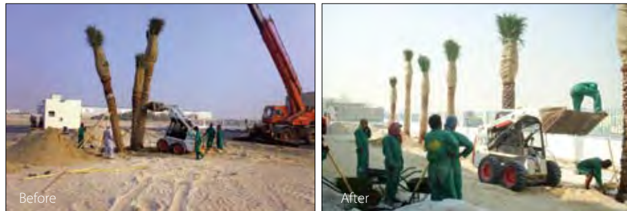
Fig. 4. Dubai, UAE palm test in 2007 (1)

of the transplanted plants. The general qualitative parameters of two basic humic ameliorant products are represented in booklets or at web-site www.aridgrow.info